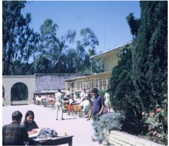
Lunch room outside

Statistics show that 80% of Christian students leave the church after they have attended a secular college. They have a good Bible foundation but are unable to debate the professors. I explain why that is the case in this paper.