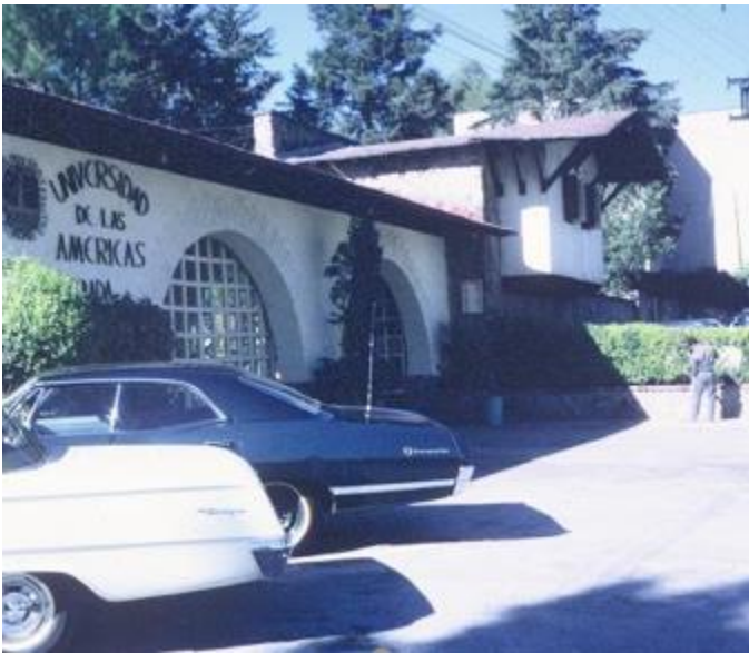
Entrance to the College